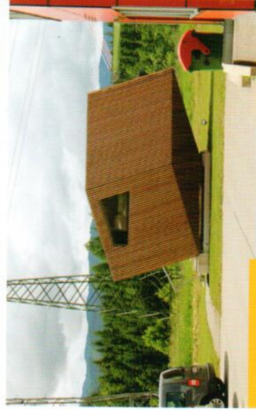
Cluster of wood processing Holzcluster in Zeltweg, Austria.