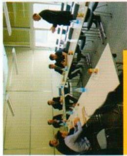
Wood processing cluster Lesarski Grozd in Ljubljana, Slovenia