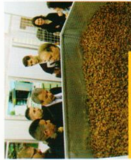
Visit of wood processing fair in Virovitica, Croatia