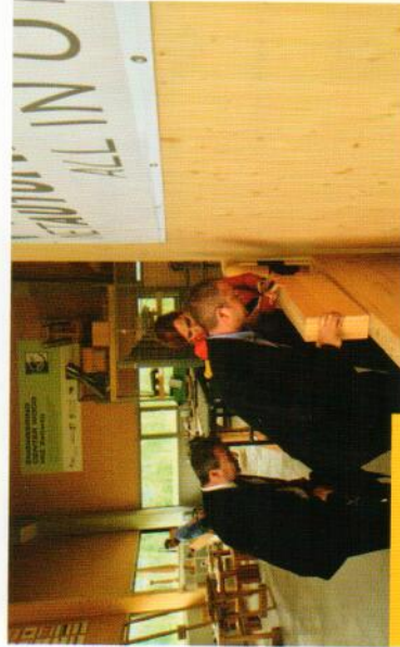
Cluster of wood processing Holzcluster in Zeltweg, Austria.

Business Support Centre Kosovo (BSCK), Community Development Fund (CDF), Municipality of Ferizaj, Municipality of Kacanik, Municipality of Shterpece.